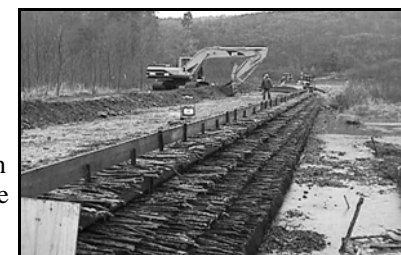
A bioengineered shoreline stabilization project in Wahkiakum County, WA using willow branches.

Integrated methods employ a combination of protective structures and vegetation. An example is the planting of willows interspersed with riprap or other hardened structures. The rock provides immediate resistance to erosion and the willows, when their roots are established, bind together the rocks and underlying soil. The vegetation provides a more natural looking shoreline and streambank or shoreline habitat.