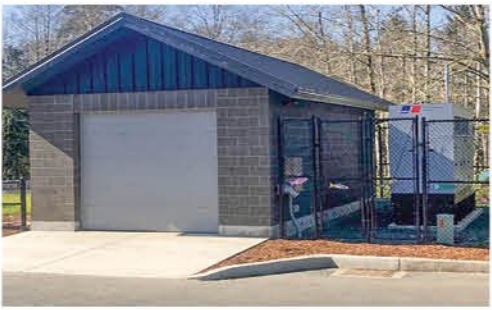
East Hills Booster Station

No one knows more about your water supply than City of Seaside Water Department. For more information, visit www.cityofseaside.us or call 503-738-5112