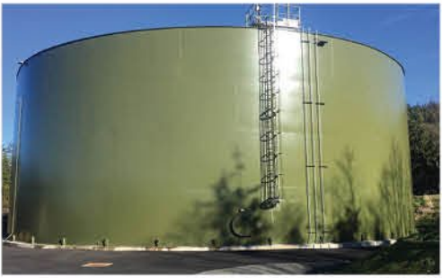
East Hills Reservoir

If your home was built before 1987 lead solder may have been used to connect your copper pipes. The longer water sits in pipes better the chance you may develop lead and copper in your water. Let the water run from the tap before using it for drinking or cooking. Any time water in the faucet has gone unused for more than six hours, flush the tap by running the cold-water faucet until the water is noticeably colder, usually about 15-30 seconds. Toilet flushing or showering flush water through a portion of your home's plumbing system, you still need to flush the water in each faucet before using it for drinking or cooking.