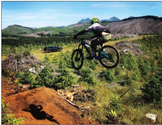
Mountain Biking at Klookchy Creek.

Seaside Jazz & Blues received $5,000 for the inaugural Seaside Jazz & Blues from March 15-17, 2024. This three-day event will feature diverse forms of jazz from 16 bands at the Seaside Convention Center. Proceeds will benefit the Kyle Rieger Memorial Scholarship Fund, helping Seaside School District students pay for band camps, instrument rentals/purchases, and scholarships for seniors pursuing music.