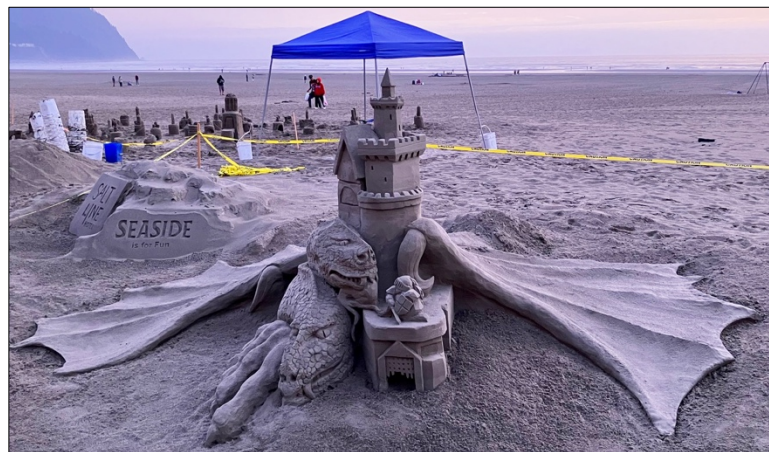
Seaside SandFest sculpture from the 2022 event.

Doxies of PNW Club received $2,000 for DachSand , a dachshund dog meetup, in Seaside from Sept. 8-10, 2023.