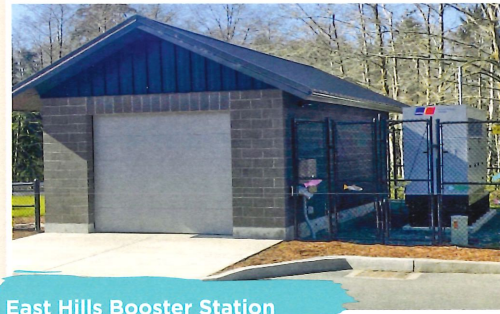
East Hills Booster Station

No one knows more about your water supply than City of Seaside Water Department. For more information, visit www.cityofseaside.us or call 503-738-5112